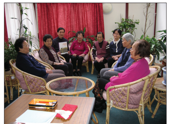
Project Co-ordinators holding focus group discussions